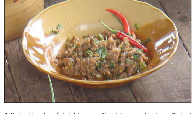
Fig. 2. The traditional raw fish dish known as "koi pla" commonly eaten in Thailand and Lao PDR.

Raw fish consumption needs to be contextualized within societies, and local attitudes that accept many different kinds of raw food consumption. Such practices are deeply rooted in local cultures, meaning that a black and white health warning about "raw meat" being bad for the body is effectively at odds with long-held practices, local belief systems, and collective rituals utilizing dishes such as " koi pla " (a dish made from finely chopped raw fish mixed with chili,