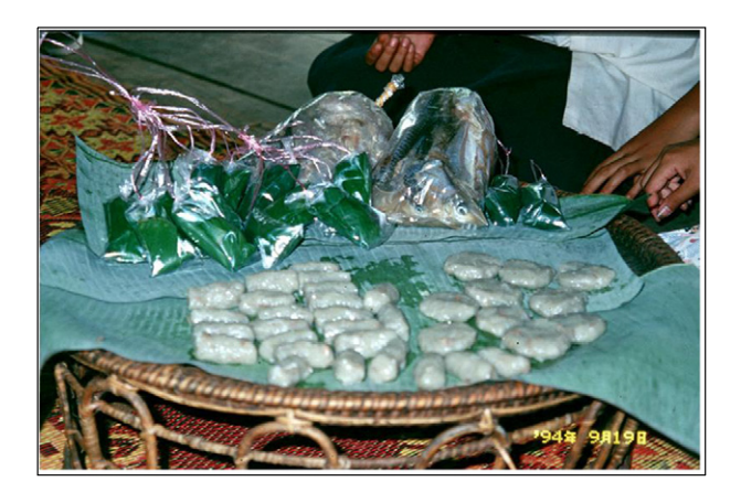
Fig. 3. The short term fermented fish preparation (pla som) in Lao PDR. It is usually kept for 1–2 days before consumption.

Lack of adequate sanitation and hygiene control systems are also linked to the spread of the O. viverrini parasites. Eggs from adult flukes must reach water before being eaten by and therefore infecting Bithynia snails. In the predominantly rural and rice-fish cultures of the Mekong Basin, hundreds of thousands of villages lack proper sanitation and public infrastructure for sewerage treatment [53]. Virtually all the farmers in Laos use temporary huts with no latrines as their "second homes" during important periods of the farming cycle [54]. In the rainy season, there is the possibility of pollution of the ponds near the village by matter containing Opisthorchis eggs, echinostome eggs, minute intestinal fluke eggs, and other parasite